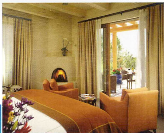
CLOCKWISE FROM TOP: Interior of one of the casita rooms; dining room at Terra restaurant; The Spa at Encantado's warming room; Casita Encantado