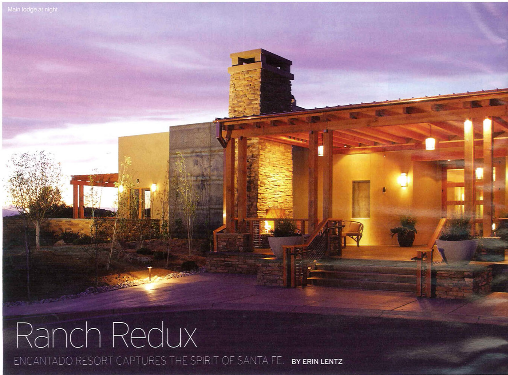
Main lodge at night