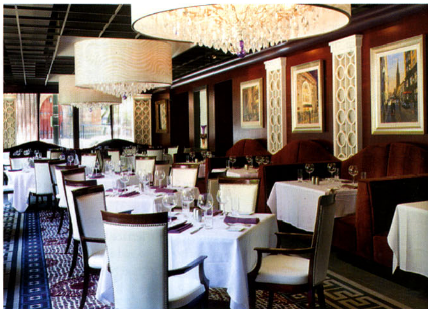
The bustling theater district of Providence, Rhode Island, welcomes its newest culinary star, Aspire.