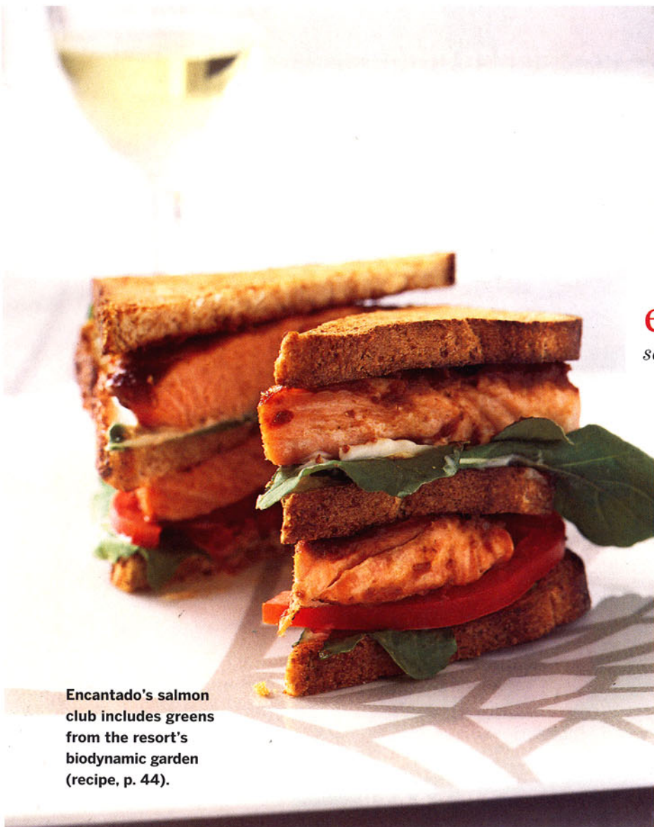
Encantado's salmon club includes greens from the resort's biodynamic garden (recipe, p. 44).

delicious—dishes onto their menus among the more decadent choices. Here are some of the best, from resorts in New Mexico, Florida, Texas and Georgia—exactly the kind of food anyone would want to eat after a two-hour massage or a killer Pilates session.