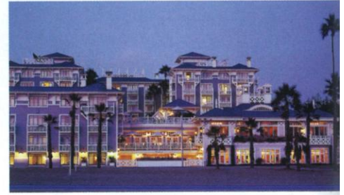
Shutters on the Beach, Santa Monica, Calif.

Sooke Harbour House (sookeharbourhouse.com): A “natural” meeting place found on Vancouver Island, B.C., this 28-room, sustainably minded property affords inspiring views of the ocean. It features many small meeting spaces and innovative, seasonal Pacific Northwest cuisine that has caught the attention of the likes of Anthony Bourdain.