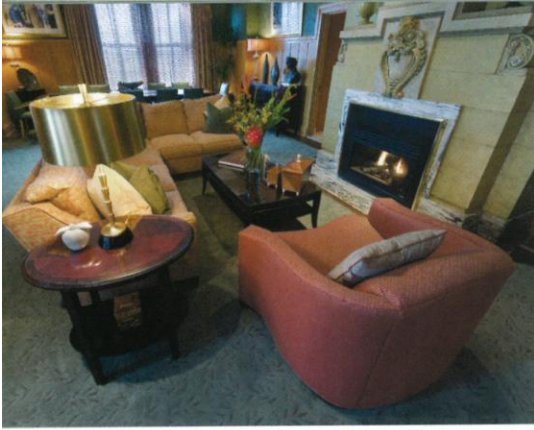
Above, Hotel Teatro, Denver; below, Encantado, An Auberge Resort, Santa Fe, N.M.

later, and the entire event was put on at a fraction of the cost of a resort.