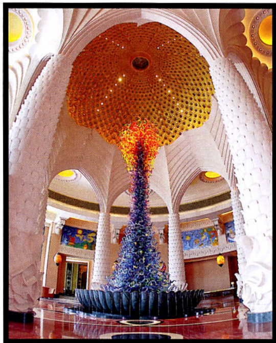
A Dale Chihuly sculpture presides over the lobby at Atlantis, The Palm, in Dubai, right. Opposite, clockwise from top left: Taking in the Atlantic views from a terrace at Canyon Ranch Miami Beach; Auberge Resorts' new Encantado, north of Santa Fe; a private picnic at Six Senses Hideaway Zighy Bay, in Oman; daybeds for two at Anantara Phuket Resort & Spa.

With its graceful plazas and arcaded walkways, this 35-acre retreat so resembles an Andalusian pueblo blanco that you'll forget you're in Arizona. To set apart its North American flagship in resort-rich Scottsdale, InterContinental created a